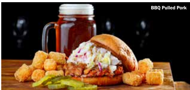
BBQ Pulled Pork