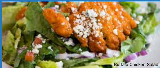
Buffalo Chicken Salad