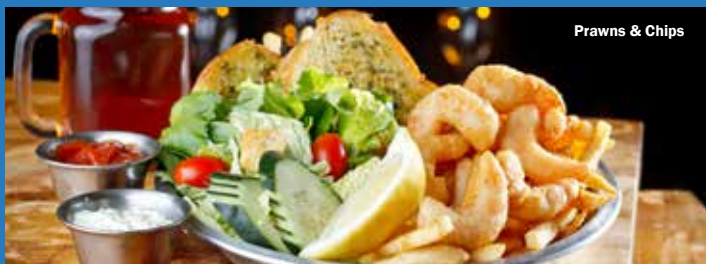
Prawns & Chips

(Served with fries, garlic bread and choice of soup of the day or green salad)