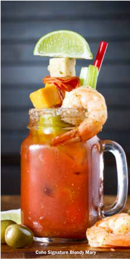
Coho Signature Bloody Mary